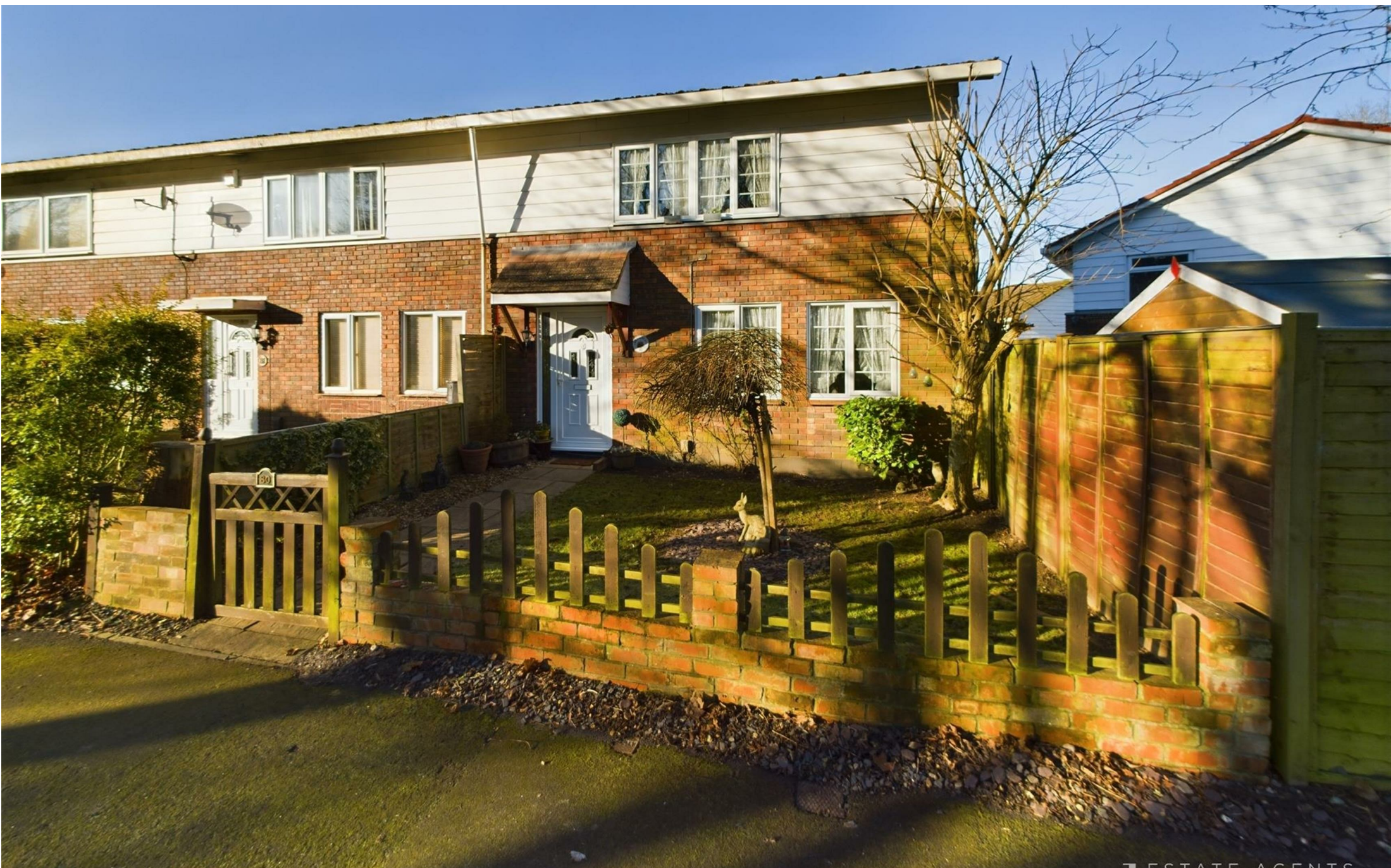
Bach Close, Brighton Hill, Basingstoke, RG22 4JZ